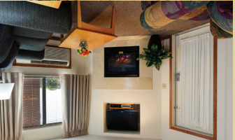
TIMBER RIDGE / WATER PARK (Free trolley transportation between buildings)

2 Bedroom Suite • 2 nights lodging • 1 king bed, 1 queen sofa $482 plus tax (room and discounted campus fee)