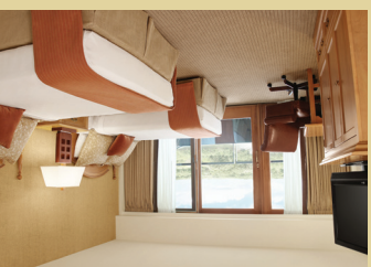
GRAND GENEVA (Conference Building)

Deluxe Guest Room • 2 nights lodging • 2 full beds or 1 king bed, depending on availability $282 plus tax (room and discounted campus fee)